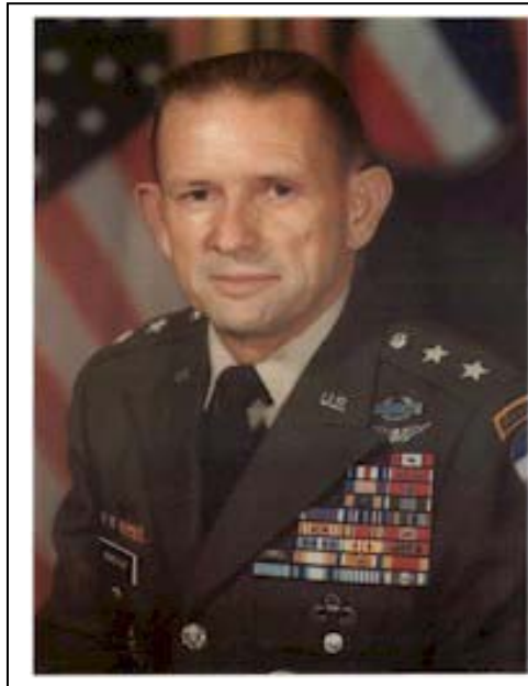
MGEN Jack Singlaub (RHOF)